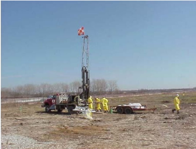
Pre-Design Investigation at the Radium Pits

In the late 1980's to early 1990's, a Remedial Investigation/Feasibility Study program (RI/FS) was performed at SLAPS under two Department of Energy contractors. PE reviewed the historical RI/FS reports with respect to the radiological and chemical analytical results, hazardous waste clean-up levels, contamination depths, and surface elevations and locations. This information was entered into ArcView 3.2 (Geographical Information System) and used to create 3-foot layers of contamination from surface to the maximum depth of excavation. PE evaluated data gaps and anomalies and identified areas that required additional investigations, which resulted in pre-design investigations (PDI).