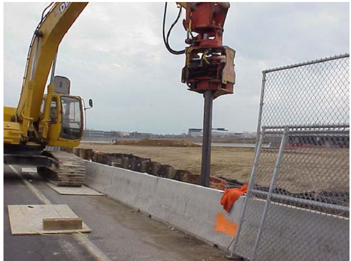
Sheet Pile Installation along McDonnell Boulevard

Geotechnical investigations were performed at SLAPS along highways and railways. Standard penetration tests, torvanes, and pocket penetrometers were performed during drilling and sampling efforts. Additional samples were taken in accordance with ASTM standards for triaxial tests, unconfined compressive strength tests, atterburg limits, moisture content, USCS, and gradation. Soil classification and strength data such as moist unit weight, cohesion and angle of internal friction was determined from lab results and used to calculate loaded and unloaded excavation slopes as well as an unsupported or cantilevered sheet pile excavations along McDonnell Boulevard and Norfolk Southern's Railroad.