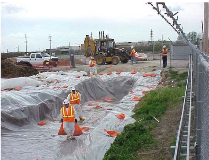
Tarpping an excavation before a Storm

RAs were designed to be from east to west and from shallow to deep excavations based on the surface water and ground water flow of the site. These were the primary driving factors for how the excavation was engineered. Additional factors were sheet pile, current status of the RA, and time of season the RA was to be performed.