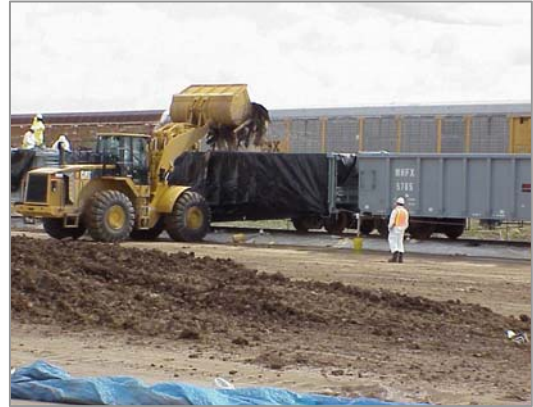
PE Superintendent Overseeing Load-out Activities

Field engineers provided on-site support including but not limited to excavation and design techniques, utility locating, water treatment, ground water and storm water control and management, equipment selection, drawing/specification modifications and clarifications, as-built drawings, field surveying and staking with a Global Positioning System and laser levels, soil and water sampling, and soil testing for transportation and disposal, utility locating, oversight of all excavation and backfill activities, and coordination with the Operations Manager.